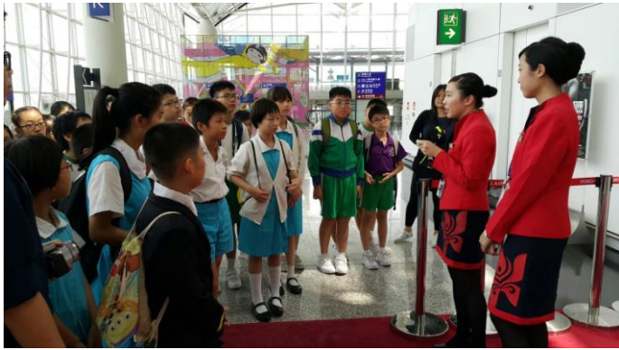
The flight crew of Hong Kong Airlines introduces the ground service facilities of the airport.

The one-day tour allowed the youngsters to be exposed to different facets of the aviation industry, including cabin services, aircraft safety, catering, airport check-in and daily operations. Besides being thoroughly entertained, the students were able to broaden their minds.