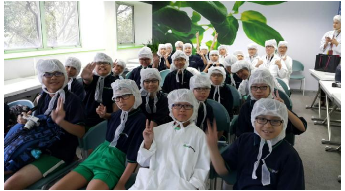
The students are all set to visit the kitchen, having received a briefing from Gate Gourmet Hong Kong Limited.